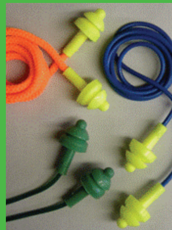
Silent Fit Two Flange Patent no -69820878.1