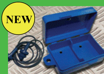
***New*** Ear Plug storage box