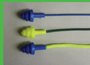
Silent Fit Three Flange