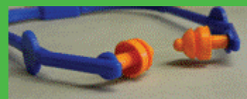
* Expand-a-band Design Allows Ear Plugs Be Clear Of Work Surface